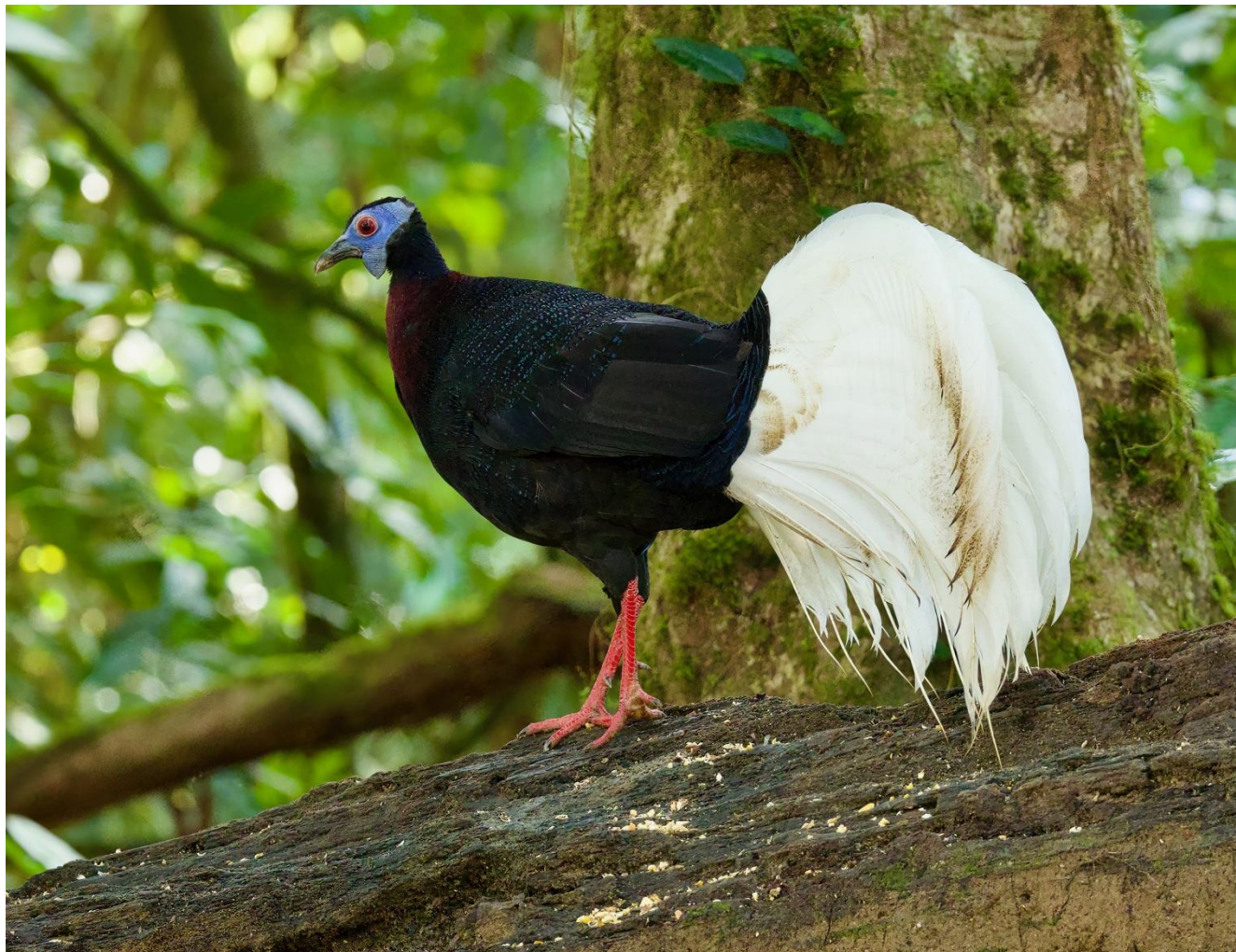
Bulwer's Pheasant – now a regular at Trusmadi Bird Station.

The number 1 target here is the rare and endemic Bulwer's Pheasant. Previously, this bird was considered in the 'near mythical' category but is a regular sighting at Trusmadi. Other notable species would include Crested Partridge, Bornean Banded Pitta, and Orange-headed Thrush. All quality birds we are unlikely to see elsewhere.