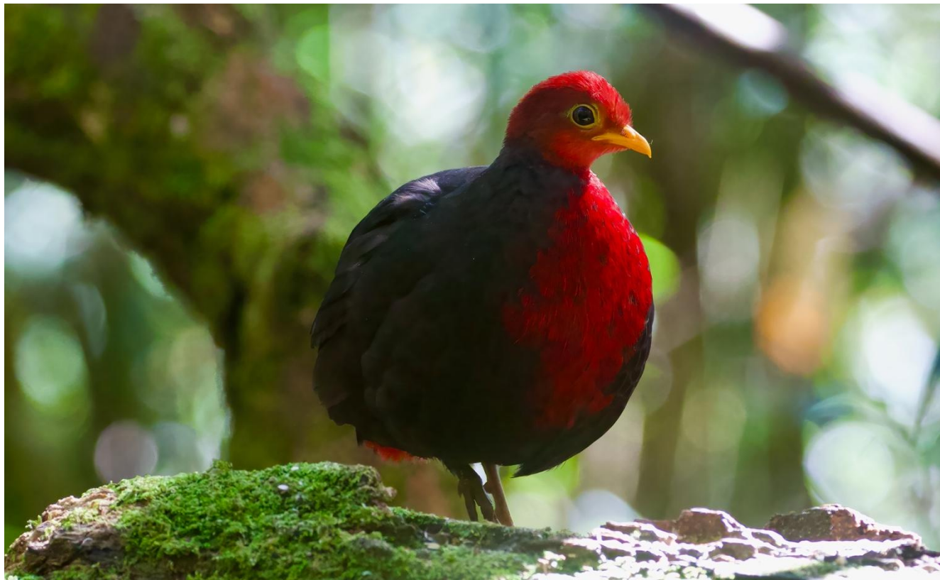
Crimson-headed Partridge. Just one of the many striking endemics we may encounter.