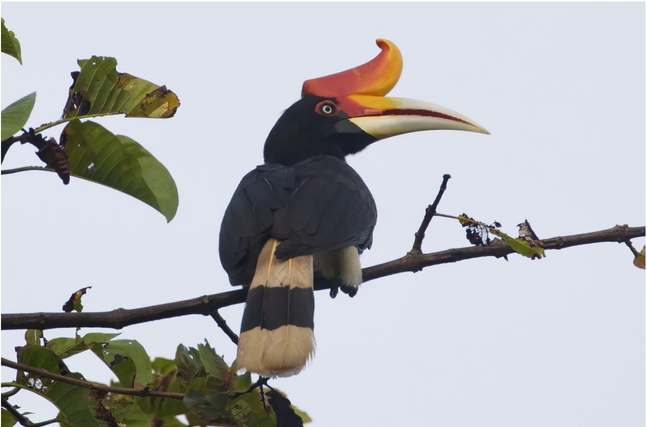
The fabulous Rhinoceros Hornbill is often observed on the Kinabatangan River.

March 25 - 26, Days 13-14: Kinabatangan River Area. We will have two full days to explore the forests along the river, where we may encounter such specialties as Cinnamon-headed Pigeon and other green-pigeons, Crimson-winged Woodpecker, Malaysian Blue Flycatcher, and Copper-throated Sunbird, among many other birds. Nearby, a very attractive forest-lined oxbow lake may harbor the globally-endangered Storm's Stork, Purple Heron, perhaps a raptor or two, and the huge and impressive Rhinoceros Hornbill.