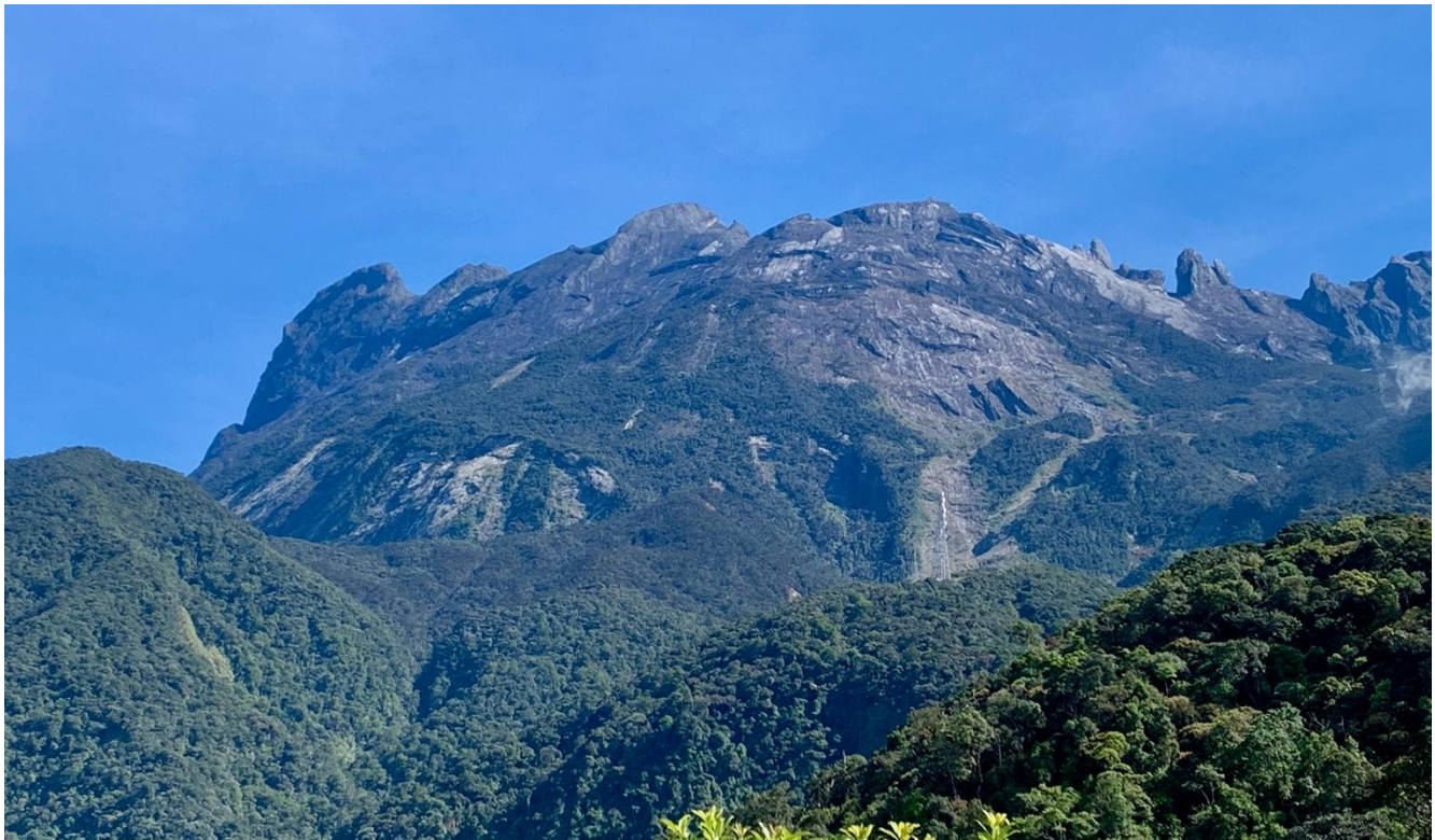
Mount Kinabalu is the highest mountain in Southeast Asia.

The magnificent Kinabalu National Park encompasses an area of 300 square miles and ranges in altitude from 1,000 to 13,455 feet, although the greater portion of the area lies above 4,000 feet. Approximately 300 species of birds have been recorded from the park, including a number of extremely local endemics. We will bird along forest-lined roads and forest trails in search of these specialties. Be aware that birding here can be extremely slow but rewarding. Although the purpose of most people visiting the park is to climb to the summit, we can see most of the specialties well below the high elevations. Characteristically in the mountains, it can suddenly become very chilly and wet; participants are advised to bring along warm clothes and wet weather gear.