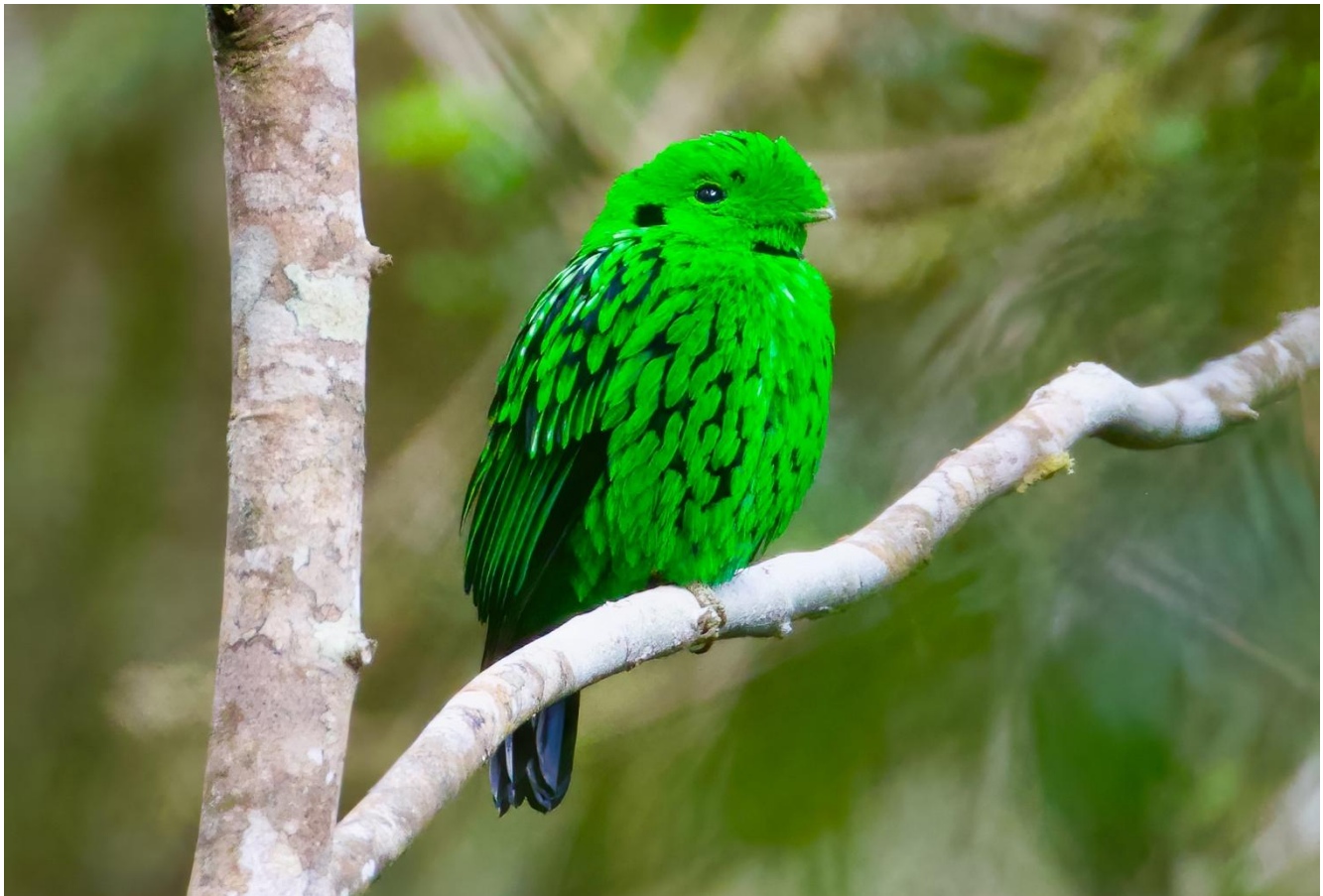
Whitehead's Broadbill is another highly sought-after montane endemic.