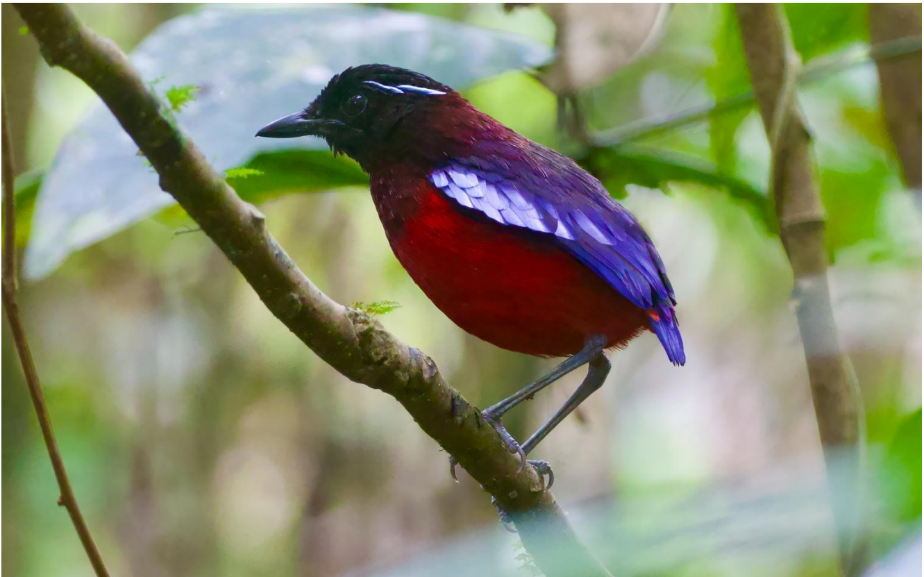
Black-crowned Pitta.

March 22 - 23, Days 10-11: Sepilok Rainforest Discovery Centre. The Rainforest Discovery Centre with its superb canopy walkway and fine system of well-established trails will be a great start to our exploration of Borneo's magnificent lowland forests. The walkway is built of steel and consequently very stable and thus unusually good for birding and photography. We will work this facility in addition to the trails and forest edge in our search for Borneo's birds, mammals and other wildlife. This is one of THE sites for the incomparable Bornean Bristlehead—one of the weirdest and most exotic looking of all of Borneo's endemic birds—and we will make a special effort to find this very elusive species. For those who wish, there will be an opportunity for a forest night-walk during which we may encounter Slow Loris or some other surprising nocturnal mammal, Brown Hawk-Owl, and with patience and fortune, at least one species of frogmouth. During our 2018 tour we were treated with a wonderful show by a very obliging Black-crowned Pitta. The family of pittas are called "jungle jewels" as they are difficult to come across but when you do, the reward is huge. We have good chance of finding one of these "jewels" in Sepilok!